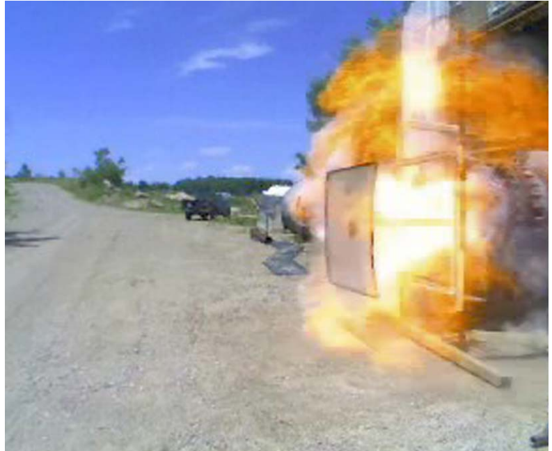
Activation of Explosion Vent by Corn Starch deflagration in 100 cubic meter test vessel

To assist in the understanding of these new requirements, we have compiled this review of frequently asked questions: