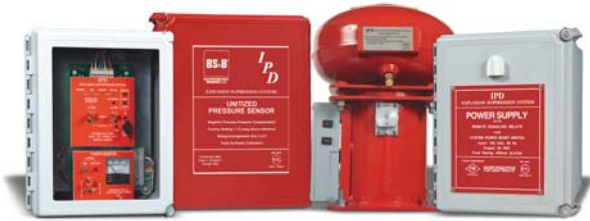
An Explosion Suppression System from BS&B From left, System Monitor, Triplex Explosion Pressure Sensor, Suppression Cannon and Power Supply.

BS&B Safety Systems, LLC. & IPD manufacture industrial protection technology to meet the requirements of NFPA 654, as well as NFPA documents 68 & 69. Please contact us if your needs include, Material Hazard Analysis, Deflagration Venting, Deflagration Isolation, Deflagration Suppression, or Process Hazard Analysis.